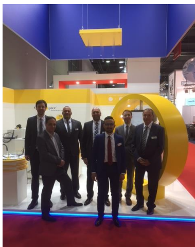
The trade fair team

We wish to recommend a visit to the SPIE Optics + Photonics from 21 st – 23 rd August 2018 in San Diego, USA. Here, CeramOptec will be represented at the stand of their Distributor US Fiberoptec (Stand No. 434). We look forward to seeing you there!