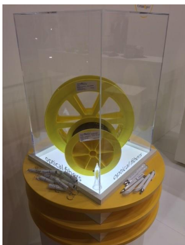
Presentation of optical fibres

Due to its internationalism, the trade fair provided an excellent opportunity to establish new contacts and to maintain existing business relationships. The offers provided at the trade fair ranged from products, detailed and system solutions, right up to applications from the wide field of optical technologies. Optical construction elements, optomechanics, fibre optics and fibre optic cables, laser components, coating technologies, and in particular, the key technology of photonics were represented here as well as systems for additive production, industrial image processing and optical measurement technology.