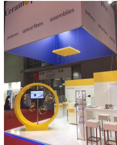
Trade fair stand at the CeramOptec

The Optatec 2018, an international specialist trade fair for optical technologies, components and systems, took place in Frankfurt am Main from 15 th to 17 th May. Here, 540 exhibitors from 32 nations presented their products to the almost 6000 visitors who had travelled from 45 countries. CeramOptec GmbH was also represented with their generously-sized trade fair stand, where objects and models were on display such as the Optran® UV NCC or the Optran® UV/WF fibre and display objects from the world of cable manufacturing.