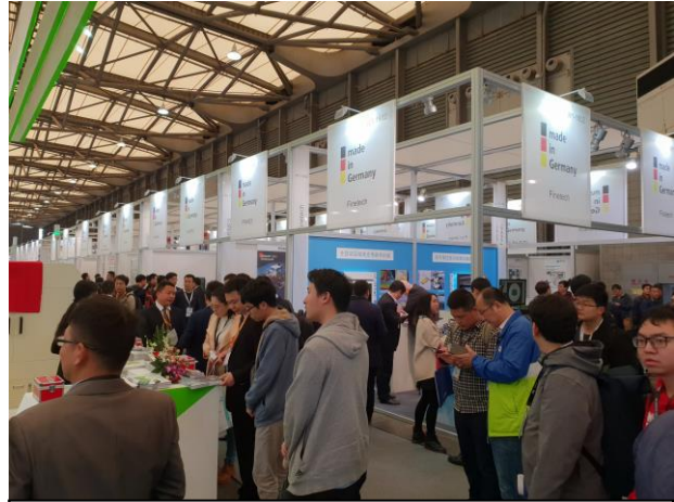
The "Made in Germany" pavilion

CeramOptec participated in the Laser World of Photonics China 2019 trade show in Shanghai at the end of the first quarter. The company was part of the “Made in Germany” pavilion at this international exhibition featuring a wide range of products. More than 1000 exhibitors from 26 countries showcased their products and services to 65,000 trade visitors in five large areas.