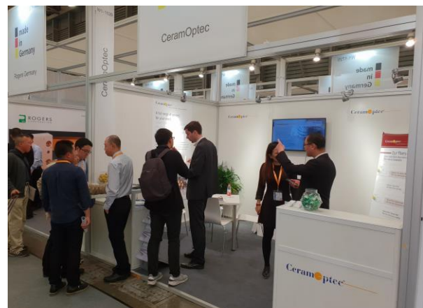
The CeramOptec booth