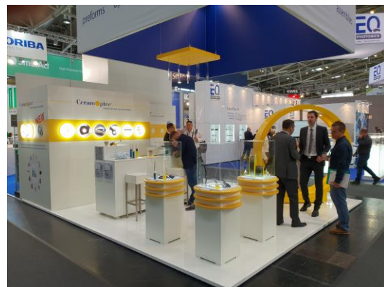
CeramOptec's trade-fair booth

With 'Safety Fiber', our innovative product, we once again achieved success. We greatly welcomed the visit of experts to our booth, who are vital partners in our development and provided us with food for thought".