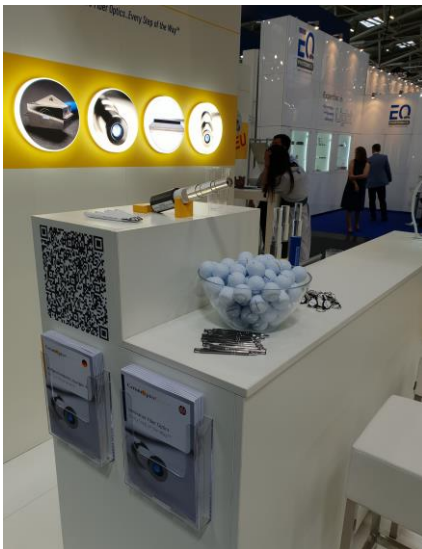
Fiber models for presentation

In addition, the many visitors to CeramOptec's booth were shown the entire range of fibers, both original as well as magnified versions, as well as various cables and bundles. Many new contacts were made and existing ones fostered and further developed during the four-day trade fair.